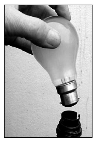
The old type of bulb

Traditional light bulbs 1) ...... be switched off for ever within four years. British Environment Secretary Hilary Benn says all homes and businesses will have to use low-energy "green" bulbs by 2011. He says that banning traditional high-energy bulbs will help Britain meet its tough carbon reduction targets. "Green" bulbs use up to 80 per cent 2) ..... electricity than traditional bulbs – which use a different filament – to generate the same amount of light. They are already becoming increasingly popular with the environmentally conscious British public.